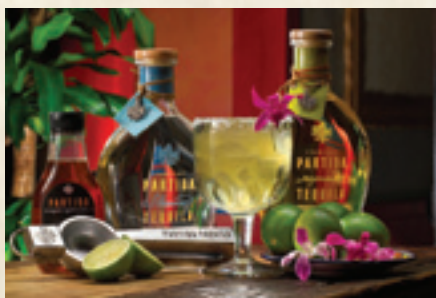
The original Skinny Margarita with Partida Blanco